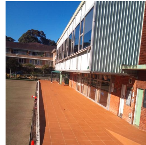
The Lane Cove Bowling Club is an ideal place to relax and unwind in a tranquil environment.